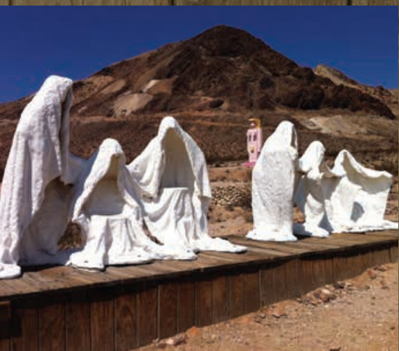
GOLDWELL OPEN AIR MUSEUM