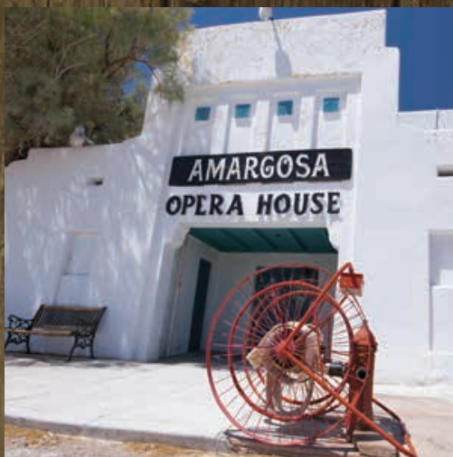
AMARGOSA OPERA HOUSE