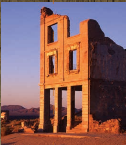
RHYOLITE GHOST TOWN